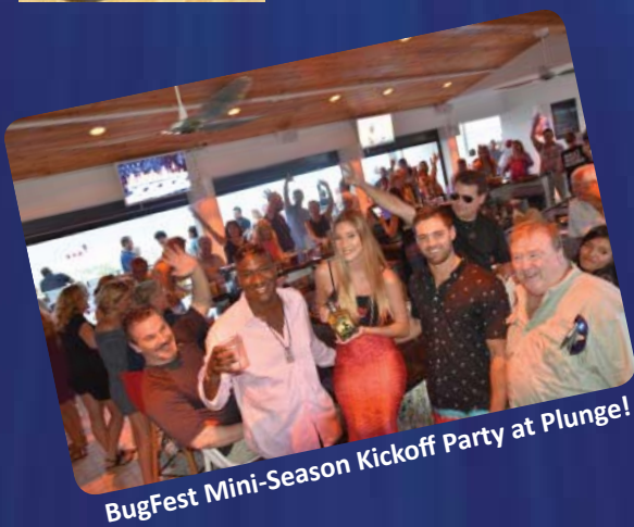
BugFest Mini-Season Kickoff Party at Plunge!

Don't miss our BugFest Mini-Season Kickoff Party from 7 to 9PM on Tuesday, July 23 at Plunge Beach Hotel , 4660 El Mar Drive, Lauderdale-By-The-Sea . Sponsored by Gold Coast Scuba , the party will feature ScubaRadio mermaids, music by the Scuba Cowboy and more. Be among the first 100 people to sign-in and receive a ticket for one free Miami Pale Ale beer, one of the more popular microbrews in South Florida. You can also register for the Great Florida Bug Hunt contest and buy a Diveheart raffle ticket for the chance to win a great dive trip.