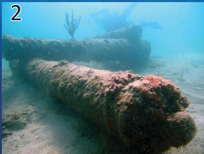
The cannons and anchor on the Shipwreck Snorkel Trail.